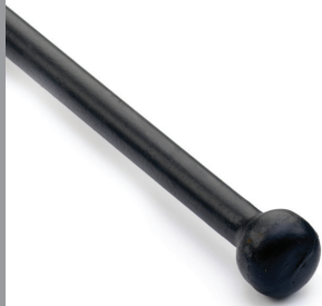
Platipus Hand Drive Rod