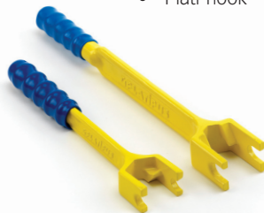
Platipus Tension Levers