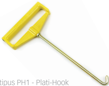
Platipus PH1 - Plati-Hook