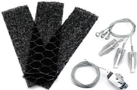
Platipus Fixing Kit